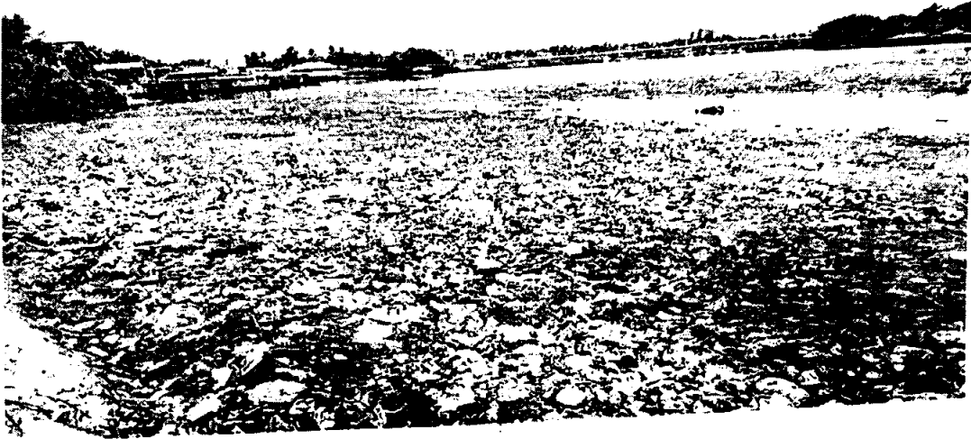
Cleaning activities being undertaken: